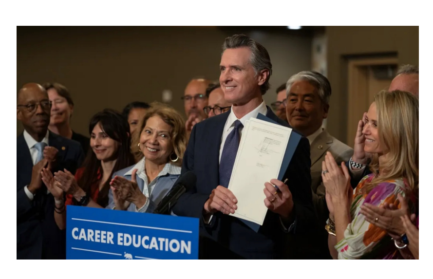
New plan due by October 1, 2024