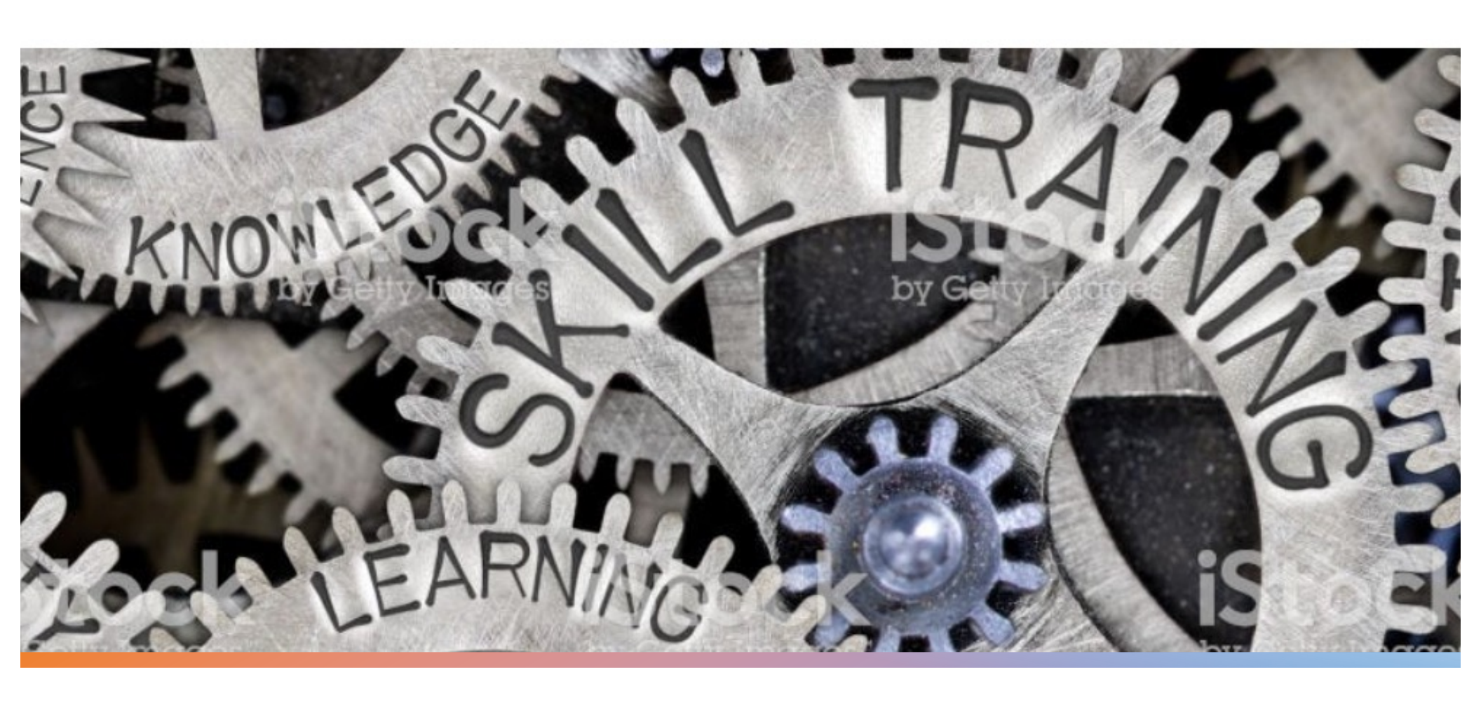
September is National Workforce Development Month