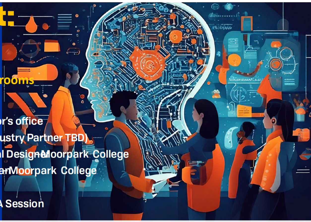
Image Credit: Adobe Firefly AI in education, multi racial students learning technology, researching