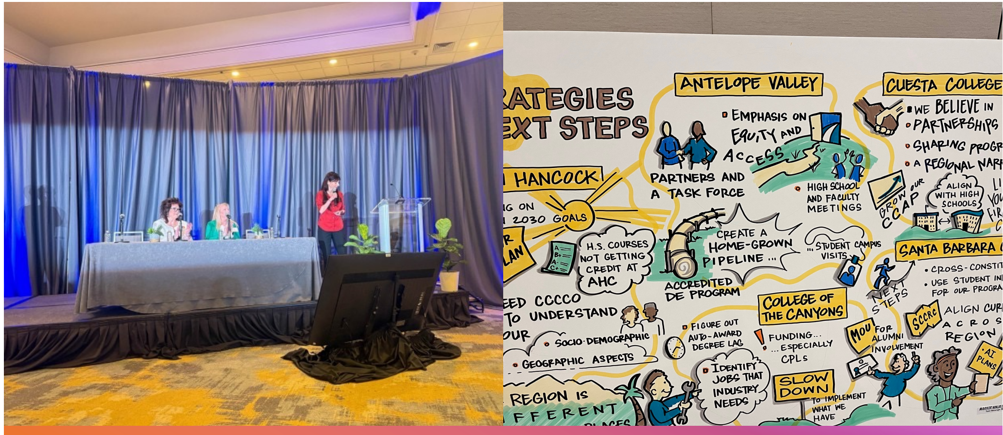
Vision 2030 Regional Workshop