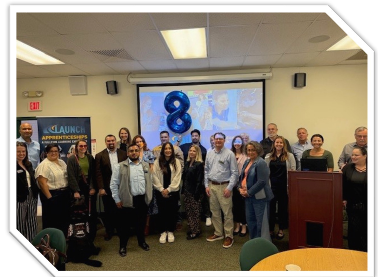
7 SCCRC Colleges and Partners participated in an Apprenticeship Convening with CCCCCO, Foundation for CA Community Colleges, and LAUNCH on Friday, April 17th at Moorpark College